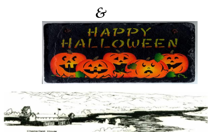
R.M. of Chesterfield # 261 News

Form E ( Subsection160.23(2) of the Act) Notice of Abandonmentof Poll