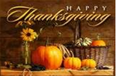
Wishing healthy & happy long weekend! Safe Travels!